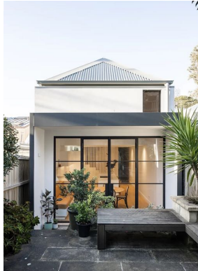
Sensitive rear extension with steel doors framing the interior and exterior spaces