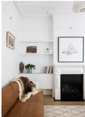
Joinery additions between the existing heritage layers of the home