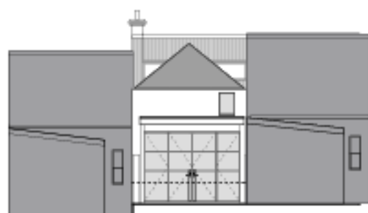
West Elevation 1:200 @A4