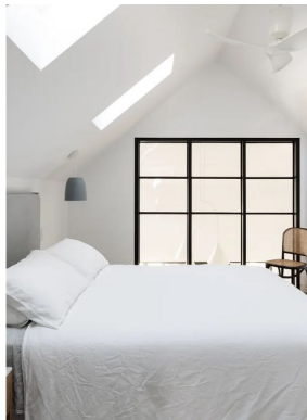
Sophisticated bedroom addition filled with natural light from the inserted skylights