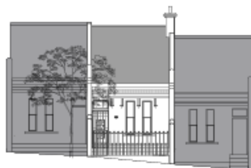
East Elevation 1:200 @A4