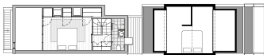
First Plan 1:200 @A4