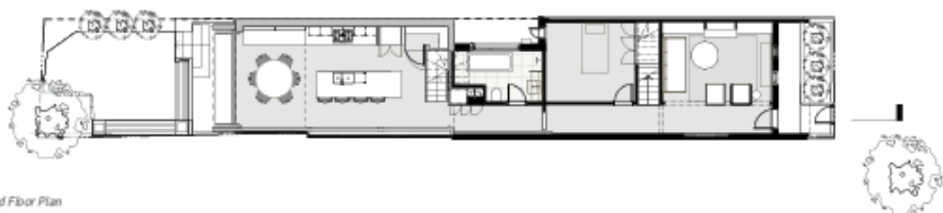
Ground Floor Plan 1:200 @A4